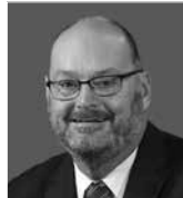
Paul Neidig Commissioner