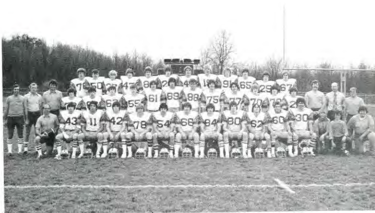
TIPPECANOE VALLEY HIGH SCHOOL District 10 Champions—Class A