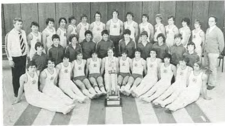
COLUMBUS NORTH HIGH SCHOOL 1977-78 State Gymnastics—Boys Champions