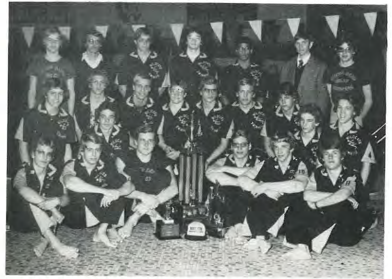
SOUTH BEND RILEY HIGH SCHOOL State Swimming—Boys Champions

*The 1931 Meet was the first IHSAA sponsored meet.