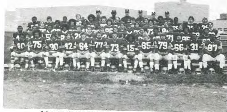
SOUTH BEND WASHINGTON HIGH SCHOOL District 2 Champions—Class AAA