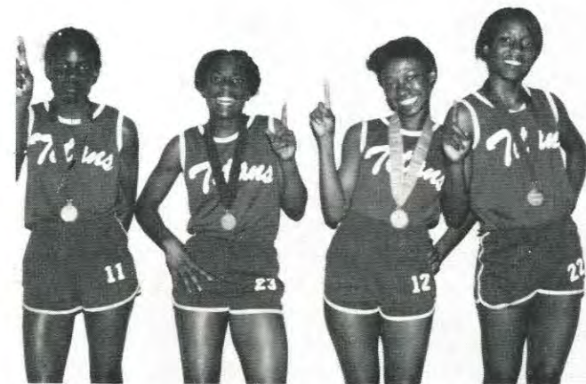
INDIANAPOLIS ARSENAL TECHNICAL HIGH SCHOOL 880 Yard Relay—New Record—1:42.4