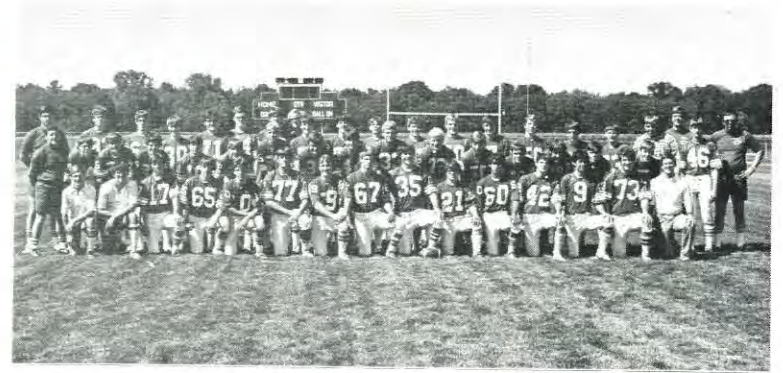
PLYMOUTH HIGH SCHOOL 1977-78 Football Champions—Class AA