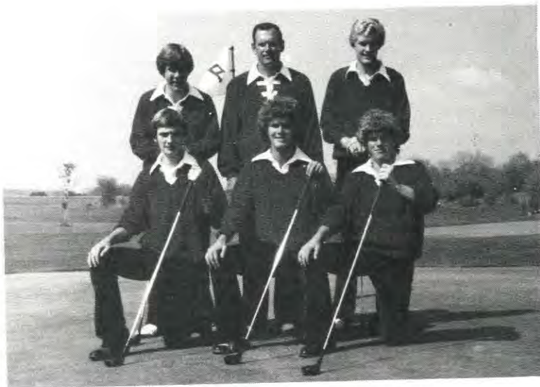
LAFAYETTE JEFFERSON HIGH SCHOOL 1977-78 State Golf—Boys Champions