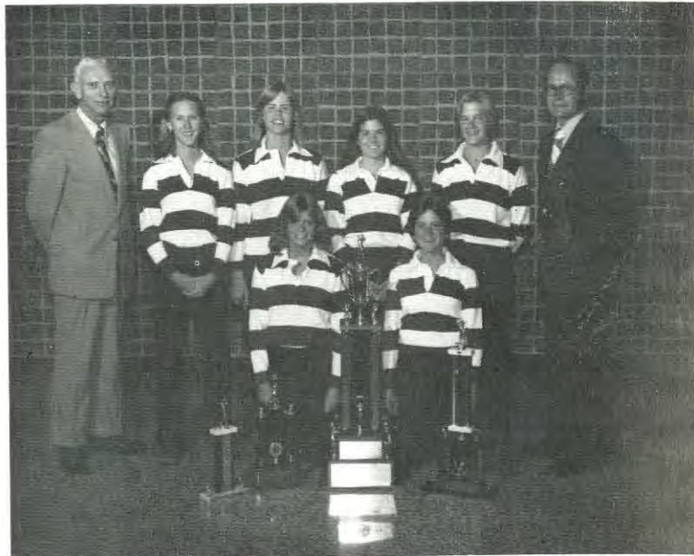
NORTH CENTRAL HIGH SCHOOL (Indianapolis) 1977-78 STATE GOLF—GIRLS CHAMPIONS