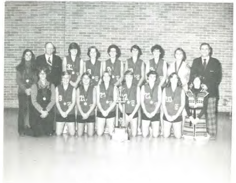
MUNCIE NORTHSIDE 1977-78 State Volleyball Champions

Leo 15-10, 15-9; Bloomington South. S.B. Riley 15-6, 15-6; Castle. Muncie Northside 15-17, 15-9; Munster. Indpls. Chatard 15-11, 15-10; North Montgomery. S.B. Riley 15-3, 15-7; Leo. Muncie Northside 15-8, 2-15, 15-11; Indpls. Chatard. Muncie Northside 14-16, 16-14, 15-10; S.B. Riley.