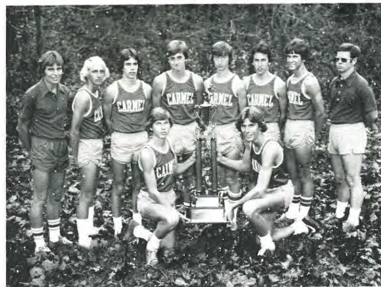
CARMEL HIGH SCHOOL 1977-78 State Cross Country Champions

*Tie broken by 4th place finishes of two schools.