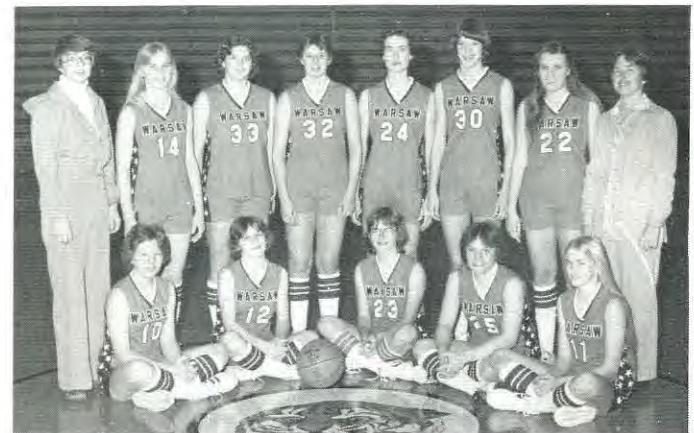
WARSAW HIGH SCHOOL 1977-78 State Girls Basketball Champions

Errors — Jac-Cen-Del 15, Warsaw 16 Attendance — 13,000 (estimated)