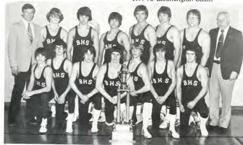
BLOOMINGTON SOUTH HIGH SCHOOL 1977-78 State Wrestling Champions