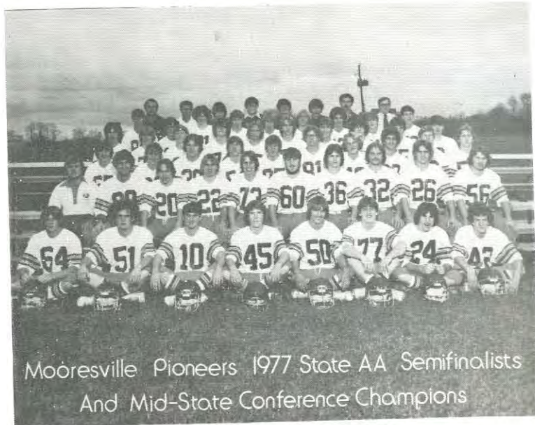
Mooresville Pioneers 1977 State AA Semifinalists And Mid-State Conference Champions