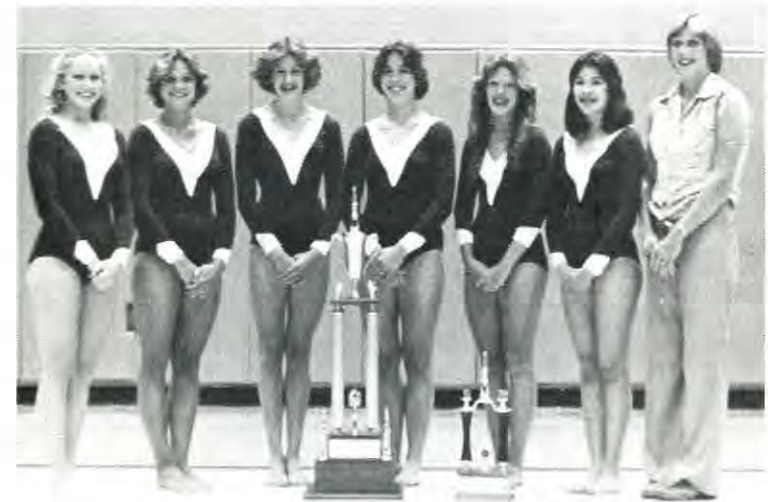
PERRY MERIDIAN HIGH SCHOOL 1977-78 State Gymnastics—Girls Champions Optional Level