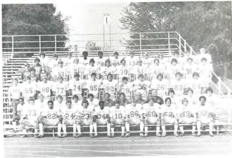
EVANSVILLE REITZ HIGH SCHOOL District 4 Champions—Class AAA