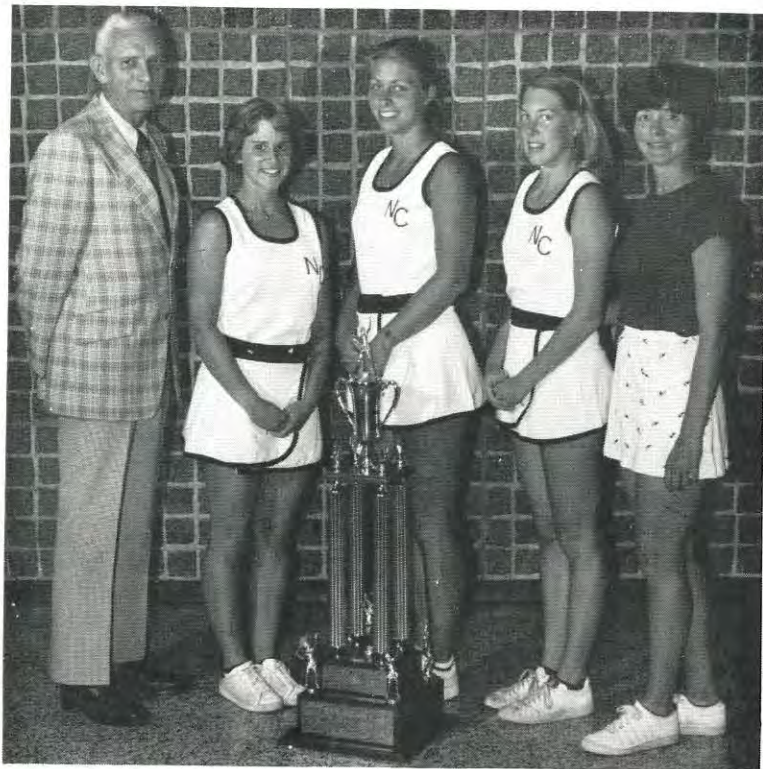
NORTH CENTRAL (Indpls.) HIGH SCHOOL 1977-78 State Tennis—Girls Champions