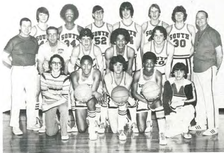
TERRE HAUTE SOUTH 1977-78 State Basketball Runners-Up