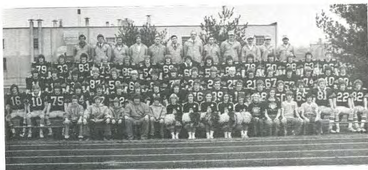
JASPER HIGH SCHOOL District 8 Champions—Class AA