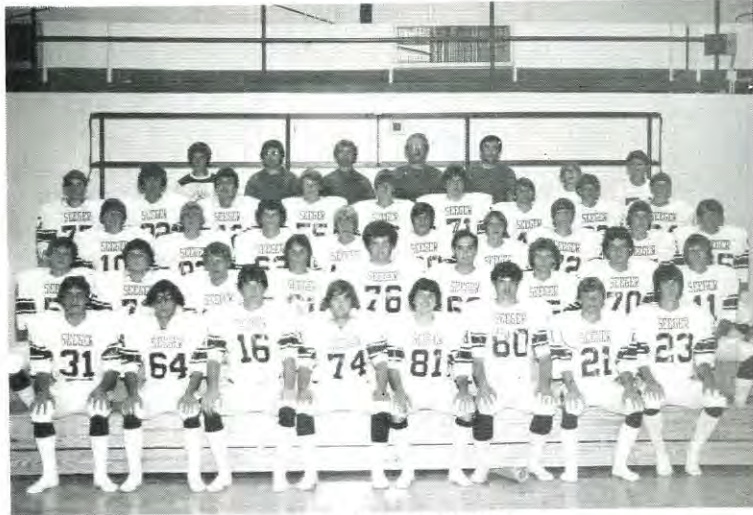
SEEGER HIGH SCHOOL District 9 Champions—Class A