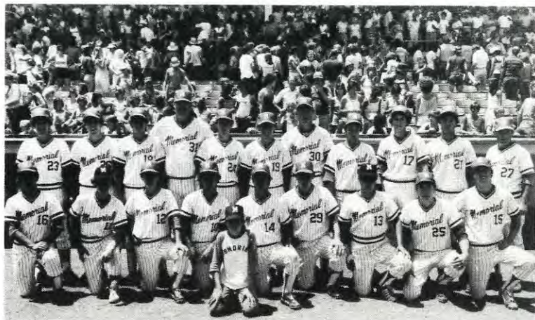
EVANSVILLE REITZ MEMORIAL HIGH SCHOOL 1977-78 State Baseball Champions