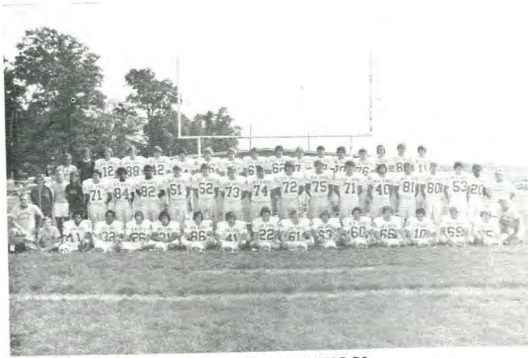
BEN DAVIS HIGH SCHOOL District 3 Champions—Class AAA