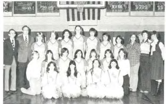
JAC-CEN-DEL HIGH SCHOOL 1977-78 Girls State Basketball—Runners-up