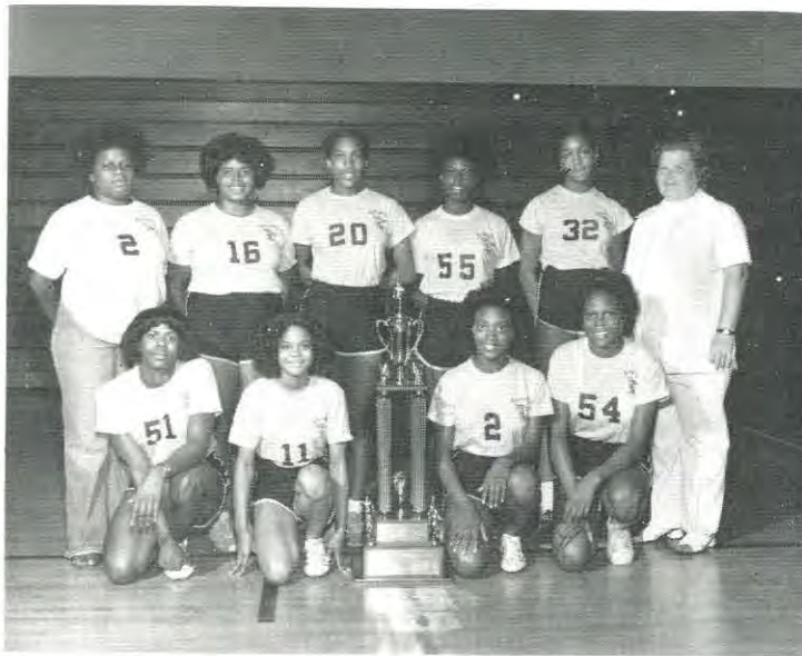
INDIANAPOLIS ARLINGTON HIGH SCHOOL 1977-78 Track & Field—Girls State Champions