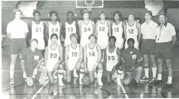
MUNCIE CENTRAL 1977-78 State Basketball Champions