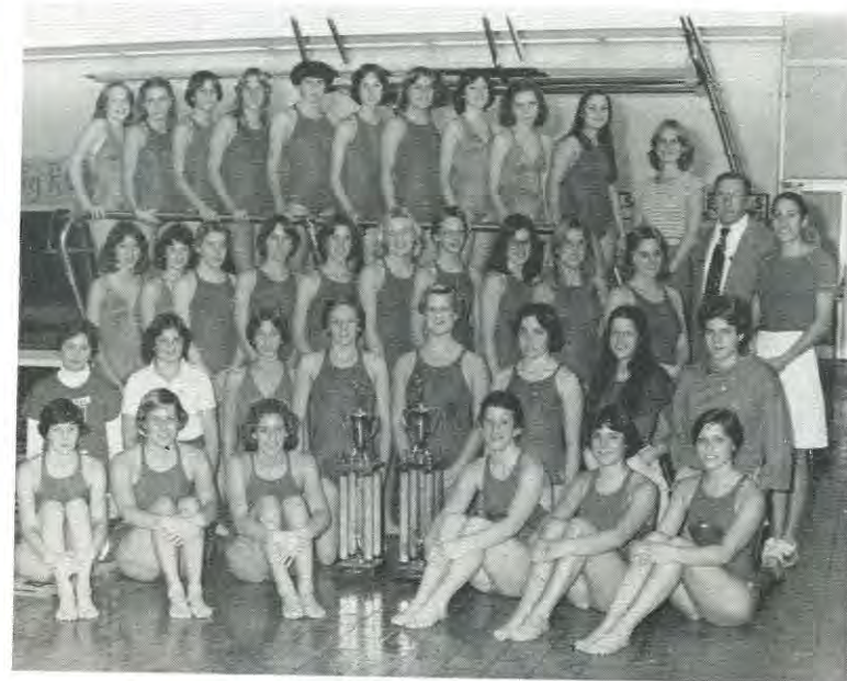
MUNSTER HIGH SCHOOL 1977-78 State Swimming—Girls Champions

Munster—147; Ben Davis—110; Terre Haute South—98; North Central—95; Hammond Noll—73; South Bend Clay—71; Merrillville—68; South Bend Riley—63; Valparaiso—62; Lafayette Jefferson—54; Crawfordsville—53; Crown Point—37; Anderson—30; Jeffersonville—25; Warren Central 23; (Tie) Elkhart Central and Brebeuf—20; Muncie Northside—17; LaPorte—14; (Tie) Warsaw and Pike—13; Perry Meridian—12; (Tie) Southport and Logansport and Lawrence Central—10; Hammond High—9; (Tie) Terre Haute North and Highland —7; (Tie) Goshen and Lowell—5; Elkhart Memorial 4; South Bend LaSalle—3; (Tie) Madison, Harrison (W. Laf.), Huntington North, Chesterton and Columbus North—2; (Tie) Muncie Central, South Bend Adams and Culver Girls Academy—1.