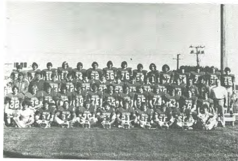
PORTAGE HIGH SCHOOL 1977-78 Football Champions—Class AAA