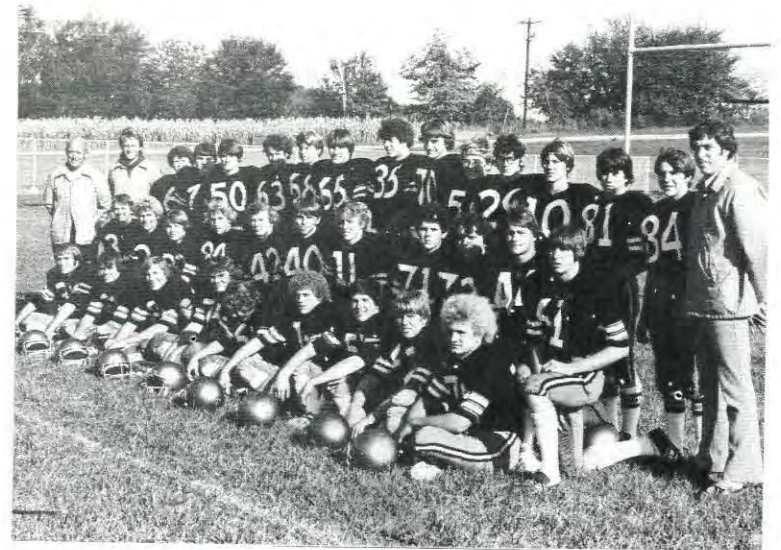
DELPHI HIGH SCHOOL District 6 Champions—Class AA