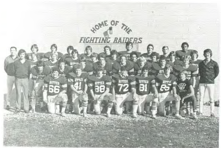
INDIANAPOLIS RITTER 1977-78 Football Champions—Class A