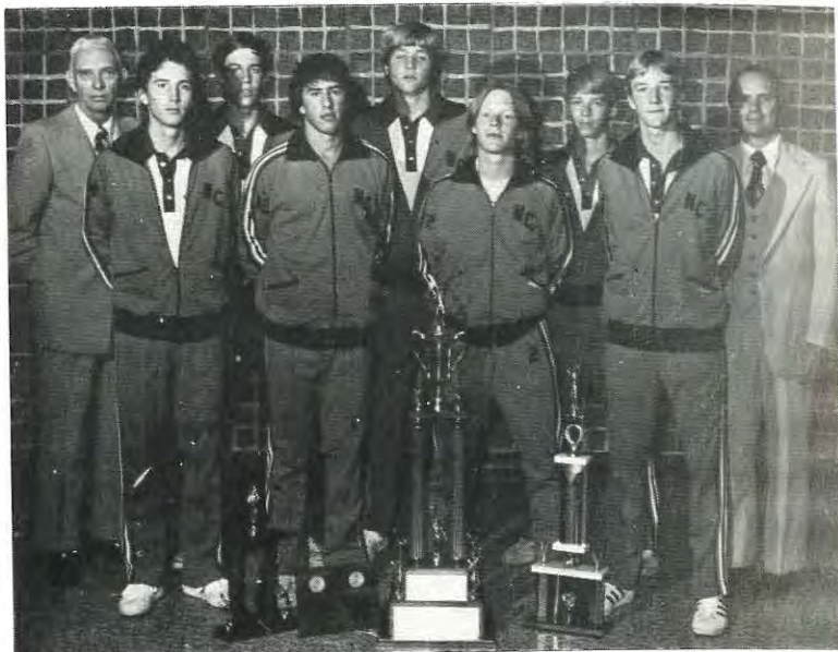
NORTH CENTRAL HIGH SCHOOL 1977-78 State Tennis—Boys Champions