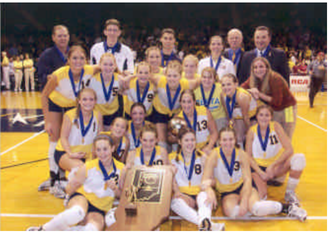
2002-03 IHSAA Class 3A Volleyball State Champion Delta HS