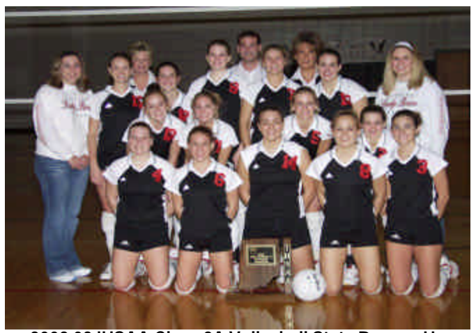
2002-03 IHSAA Class 2A Volleyball State Runner-Up Brownstown Central HS