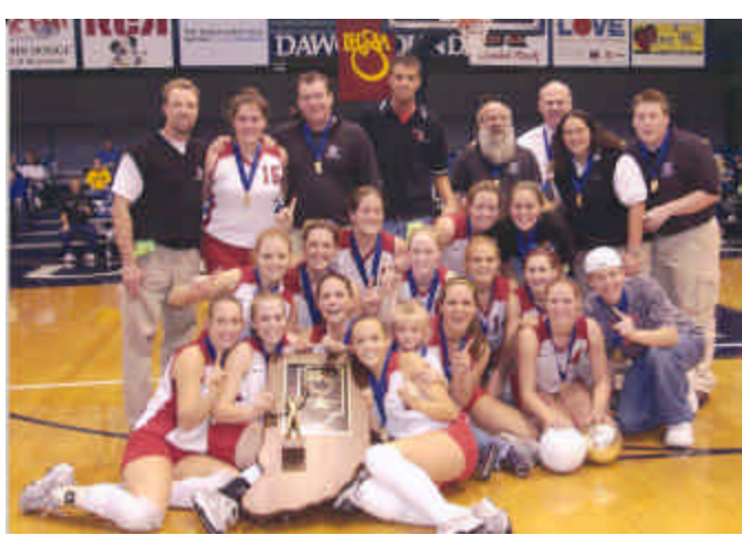
2002-03 IHSAA Class A Volleyball State Champion Wapahani HS