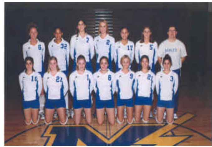
2002-03 IHSAA Class A Volleyball State Runner-Up Michigan City Marquette HS