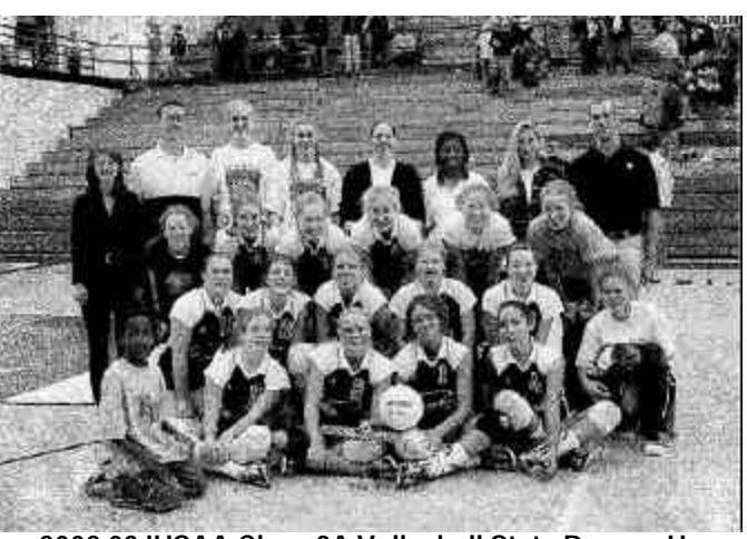
2002-03 IHSAA Class 3A Volleyball State Runner-Up Fort Wayne Bishop Luers HS