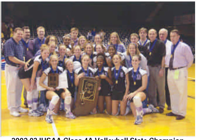
2002-03 IHSAA Class 4A Volleyball State Champion Muncie Central HS