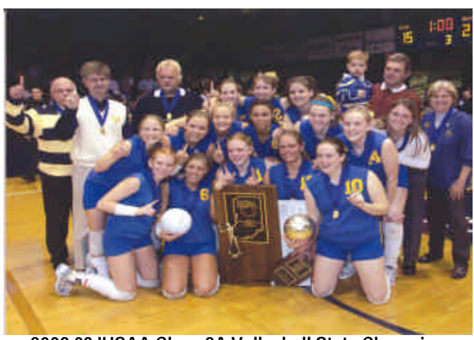
2002-03 IHSAA Class 2A Volleyball State Champion Muncie Burris HS