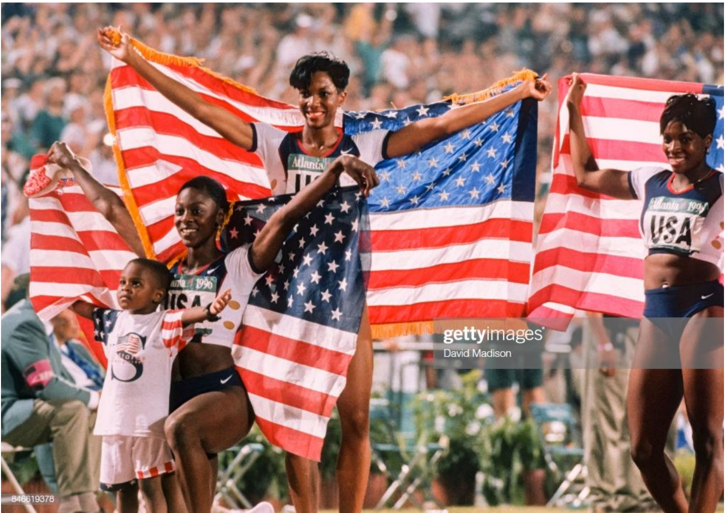
(L-R) Maichel Malone (kneeling), Rochelle Stevens, and Kim Graham, all of the USA, hold American flags to celebrate their victory in the Women's 4 x 400 meter relay event of the Athletics Competition of the 1996 Summer Olympics on August 3, 1996 in the Centennial Olympic Stadium in Atlanta, Georgia.